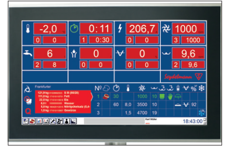
Auto-Command 4000 (optional)