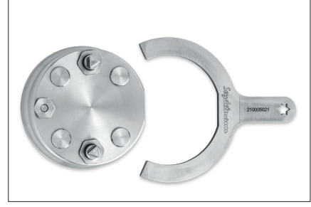
Fast clamping nut (optional)