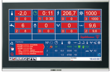
Auto-Command 4000 (optional)