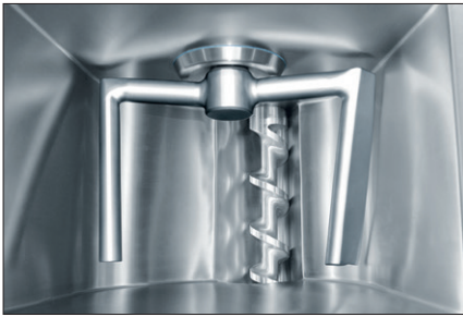
Top view: Hopper