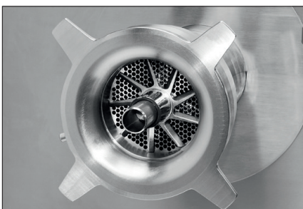
Outside knife (optional)