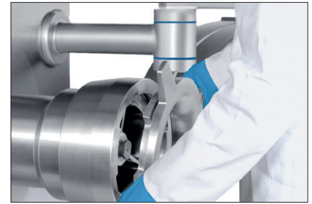
Bayonet locking (optional)