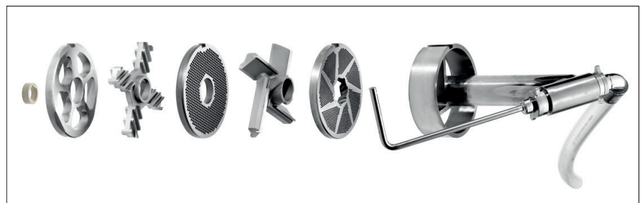
Separating set (optional)