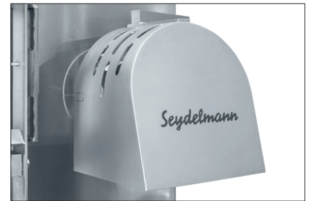
Outlet protection device (optional)