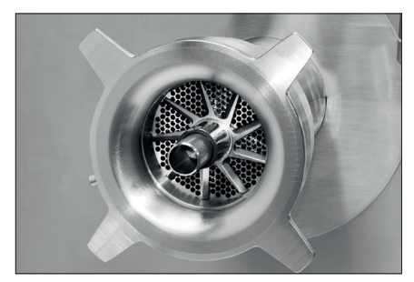
Outside knife (optional)