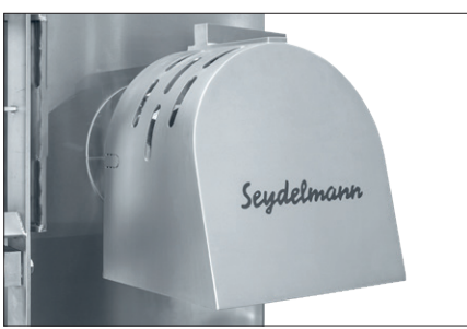
Outlet protection device (optional)