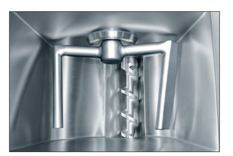
Top view: Hopper