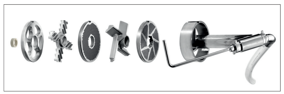
Separating set (optional)