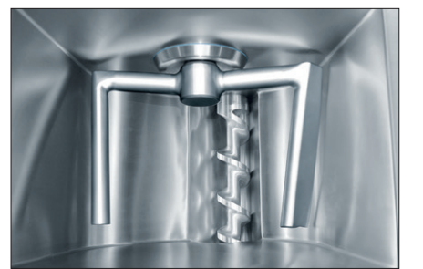
Top view: Hopper