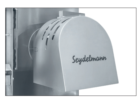
Outlet protection device