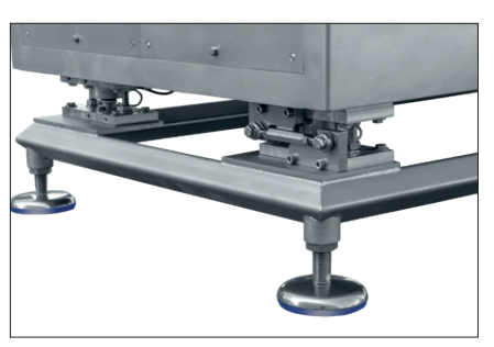
Weighing unit (optional)