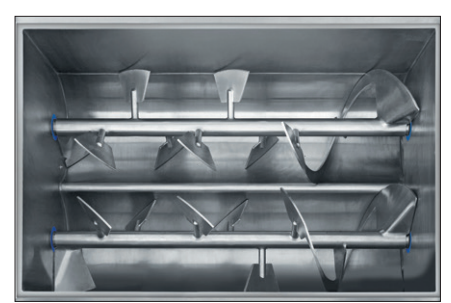
Top view: Hopper