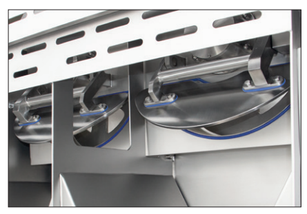
Hydraulic discharge flaps