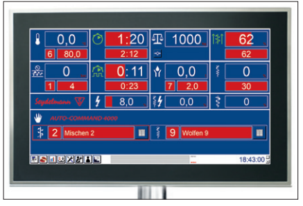
Auto Command Touch 4000 (optional)