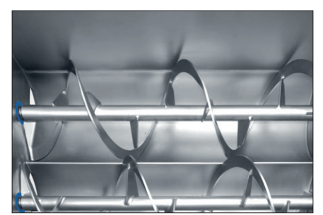
Design with mixing ribbons