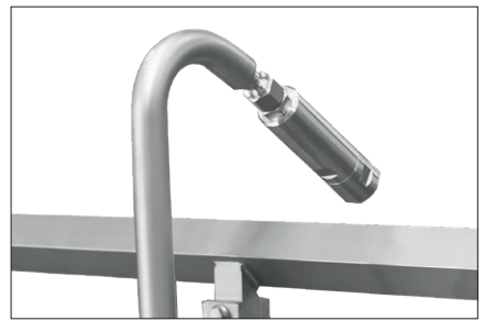
Sensor for product level (optional)