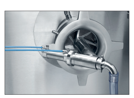
Pneumatic separating device (optional)