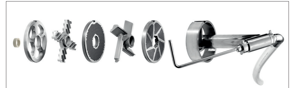
Separating set (optional)