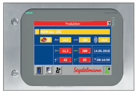
Command 700 W (optional with frequency controlled AC-6 main drive)