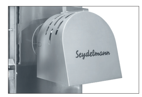
Outlet protection device