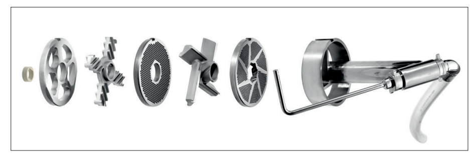
Separating set (optional)