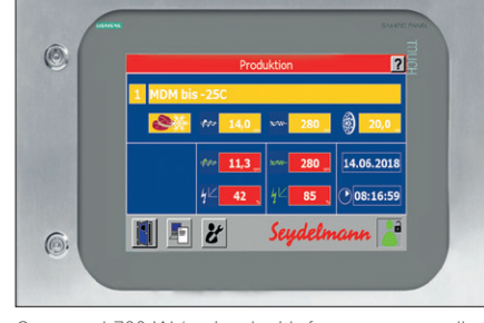
Command 700 W (optional with frequency controlled AC-6 main drive)