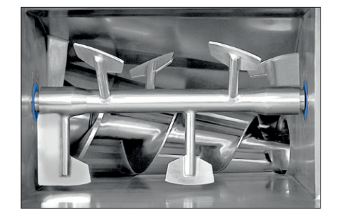
Top view: Hopper