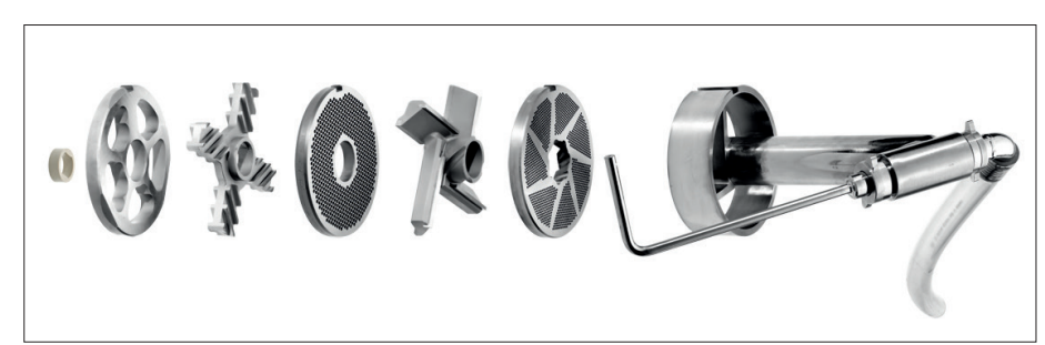
Separating set (optional)