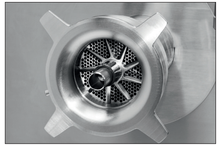
Outside knife (optional)