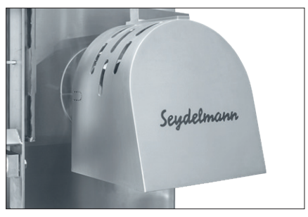
Outlet protection device