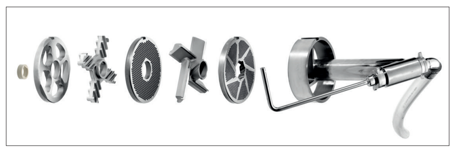
Separating set (optional)