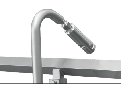
Sensor for product level (optional)