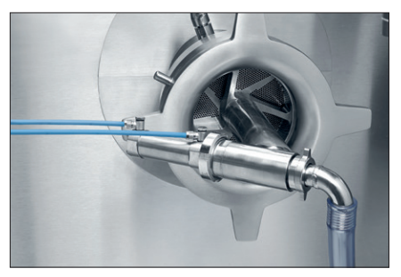
Pneumatic separating device (optional)