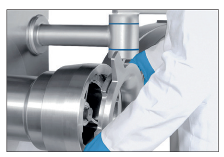
Bayonet locking (optional)