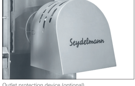
Outlet protection device (optional)