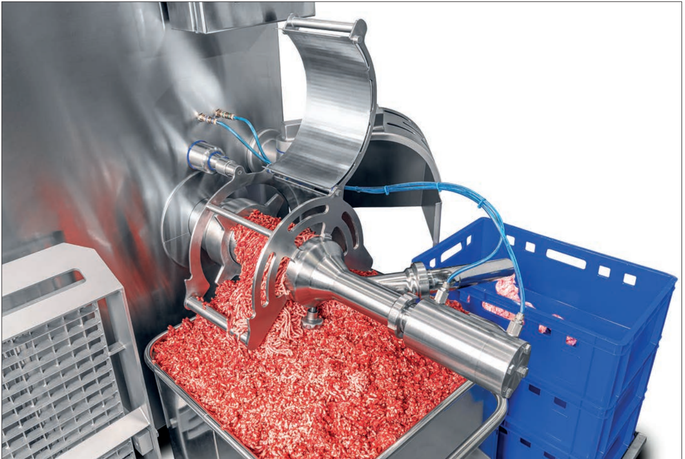
Ground meat (turkey) and separate (tendons, cartilage, and foreign objects)

The Seydelmann cutting drum, a further development of the separation set, is a specially designed cutting system for meat grinders. It is used in place of the conventional cutting set or a separation set—consisting of grinder blades and hole plates—and significantly expands the functionality of the meat grinder.