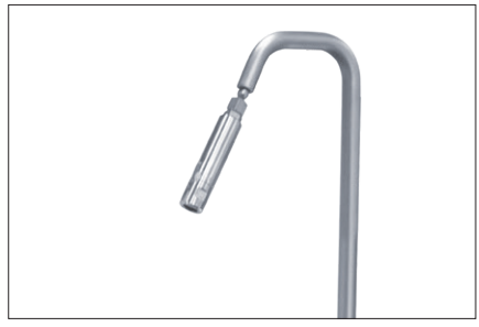
Sensor for product level (optional)