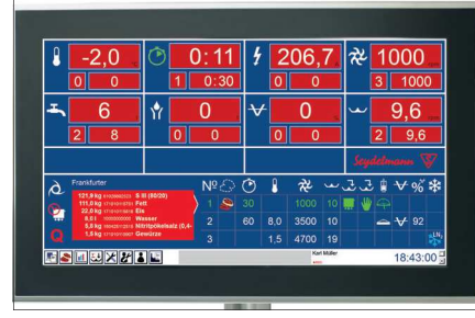
Auto-Command 4000 (optional)