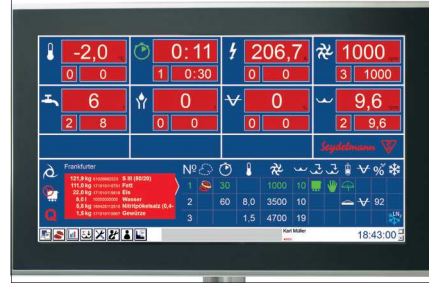
Auto-Command 4000 (optional)