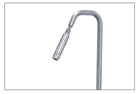
Sensor for product level (optional)